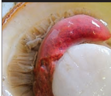
Partially spent female.