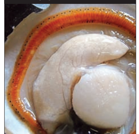
Partially spent male.